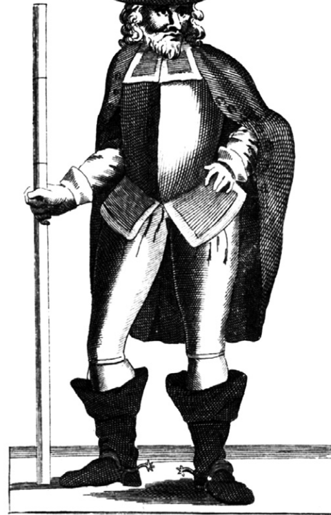
MATTHEW HOPKINS the famous WITCH-FINDER of Manningtree in Essex, who in only one year during the reign of James 1, hanged 60 reputed Witches & was himself at last executed for a Wizard.